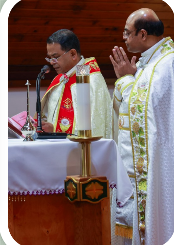
St. Josephs Feast